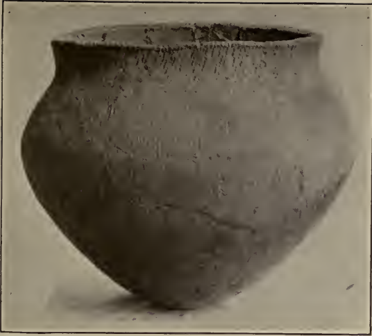
INDIAN CLAY VESSEL.